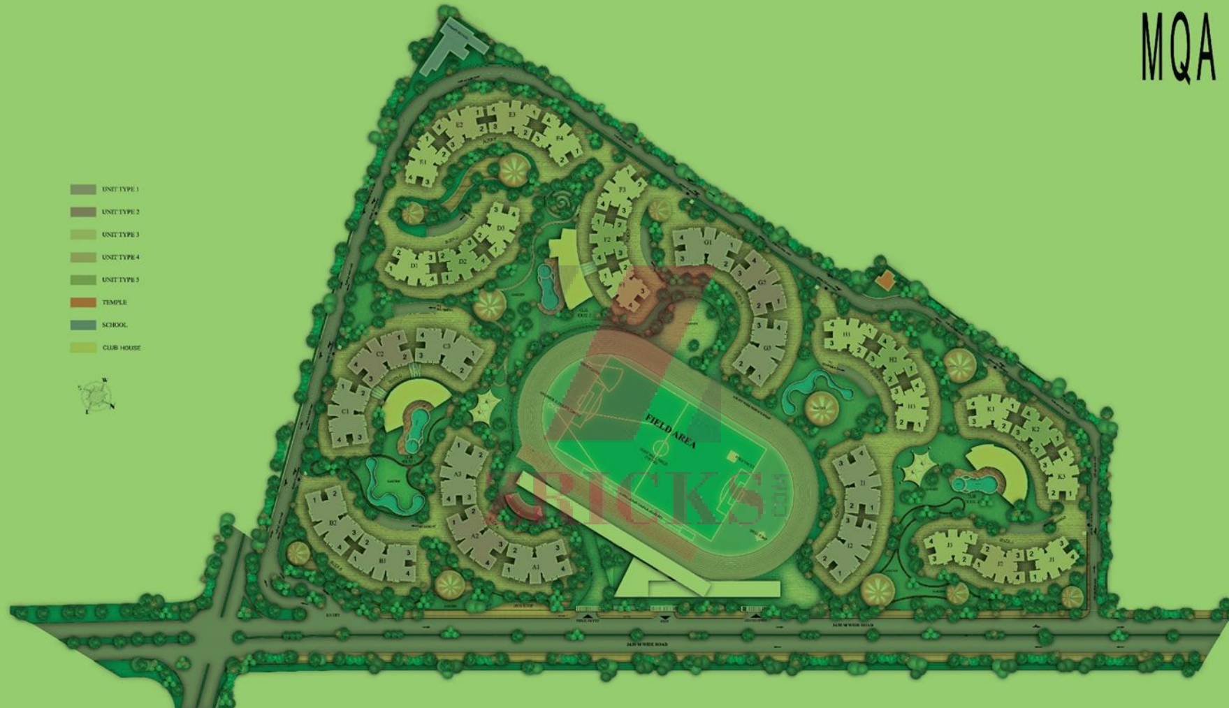
Layout of The Meadows PROPOSED RESIDENTIAL LAYOUT FOR R2 & R3 ZONE SHANTIGRAM RESIDENTIAL TOWNSHIP AT AHMEDABAD, INDIA