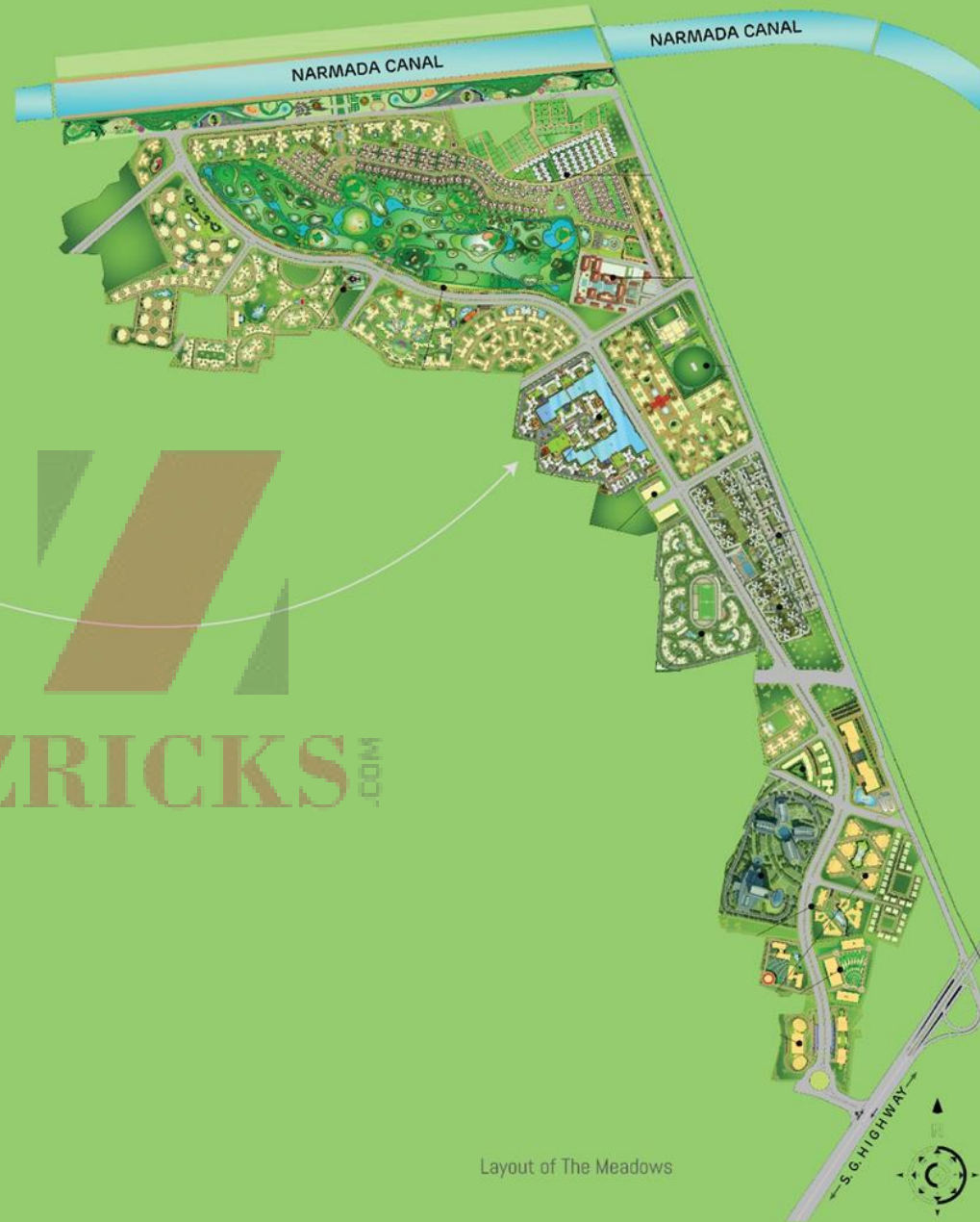
Layout of The Meadows